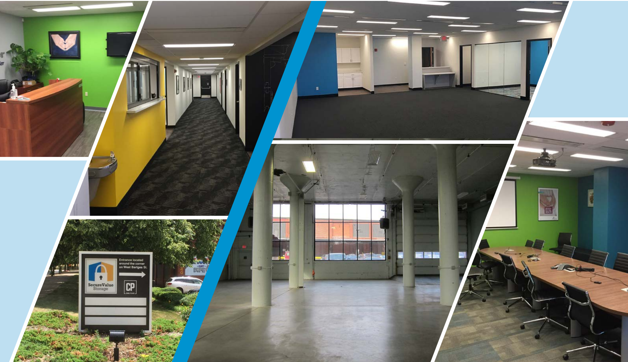
CLOCKWISE FROM TOP LEFT: Inviting interiors, remodeled and upgraded common areas throughout complex, contemporary office spaces, complementary conference rooms (three sizes available, small holds up to 14 people, medium holds up to 35 people, large holds up to 200 people), open floorplans with high ceilings, excellent tenant signage opportunities.