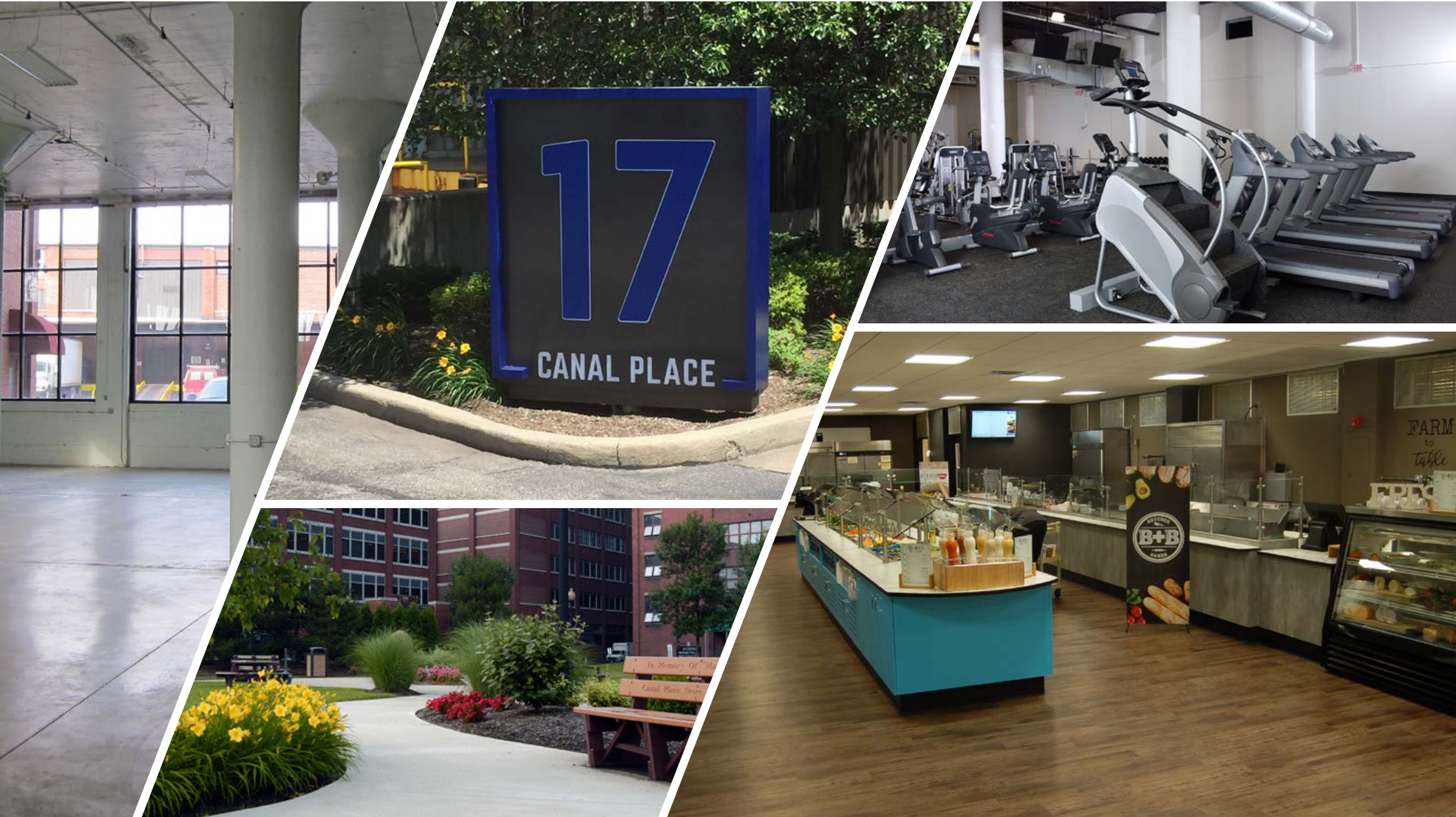
CLOCKWISE FROM TOP LEFT: Abundant natural light pours in through large windows, new self-directed signage program throughout complex, brand new 5,000 SF state-of-the-art fitness center with locker rooms, top-notch food service at the fresh new Canal Commons Café & Eatery, centrally located private 1-acre on-site park.